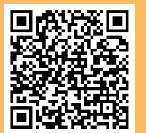
Day by Day